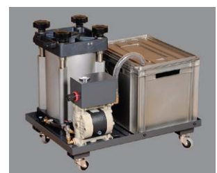
Enviro recirculating filtering unit (1 micron)